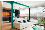
House of the Week: Color Mixing in Madrid