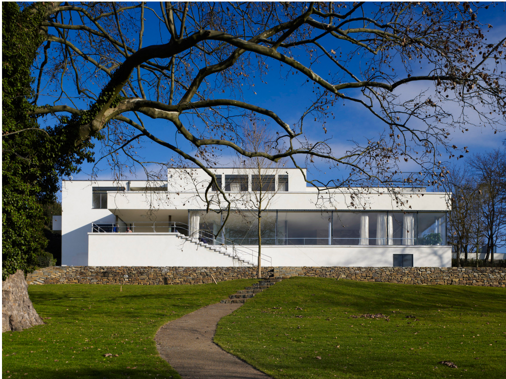
Mies's Villa Tugendhat on iconichouses.org

As you say yourself, running a 20th-century house museum is fraught with difficulty. Are you optimistic?