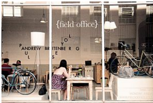
Coffee Break: Cape Town's Field Offices (Dwell)