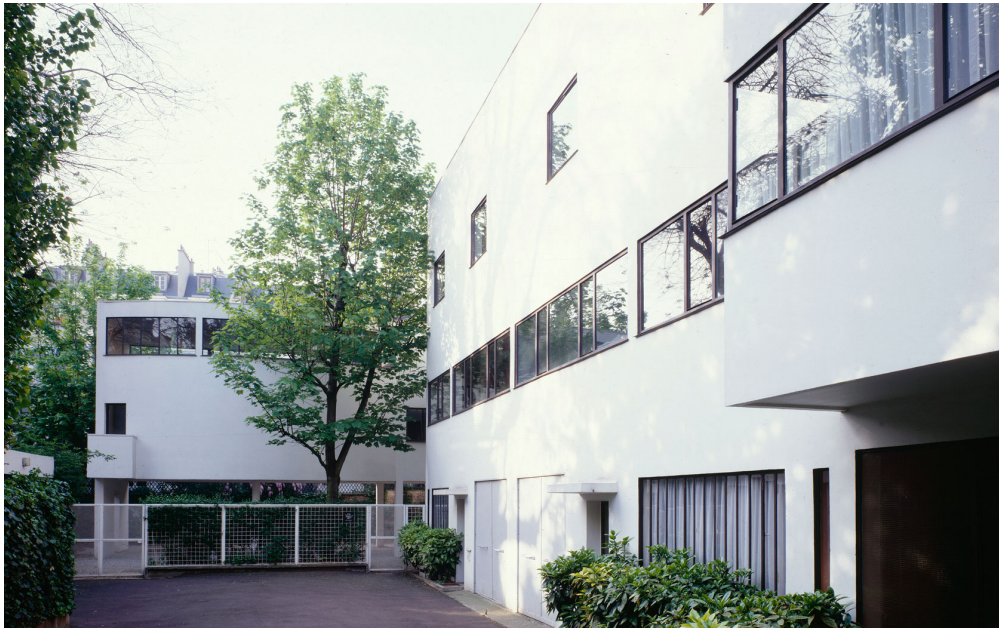
Le Corbusier's Villa la Roche

Along the way to creating the site, you also founded the Iconic Houses Network.