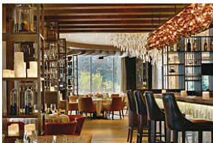
Resort Town: The Alps (Robb Report)