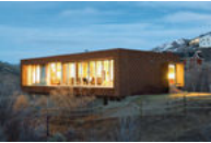
Modern Homes Throughout the Southwest