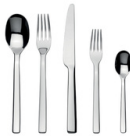
Ovale Flatware Place Setting