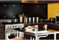
A Look at Nooks: How Modern Families Eat Breakfast