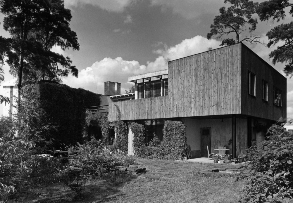
The Aalto House on iconichouses.org

Now, if you're staying in Paris, for example, our site allows you to see that you're close to the only house Alvar Aalto built outside Finland. And there are houses where you can even stay overnight—for example Vann Molyvann's hidden gem in Cambodia. So it seemed a good idea to combine travel and these iconic homes.