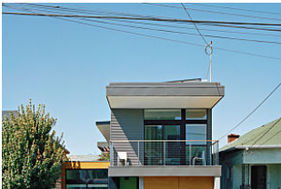
7 (Nearly) Net-Zero Homes (Dwell)