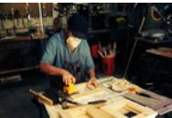
'60s Rock Superstar Micky Dolenz Creates Handmade Furniture with His Daughter's Help