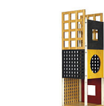
8 Striking Memphis-Inspired Designs (Dwell)